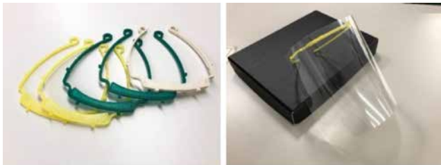
Frames produced with a 3D printer