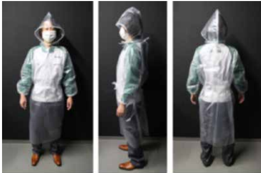
Medical gowns produced

Medical face shields were also produced from April to June and were provided through the Fuji Medical Association to medical workplaces of the Fujinomiya Medical Association, Fuji Dental Association and other organizations.