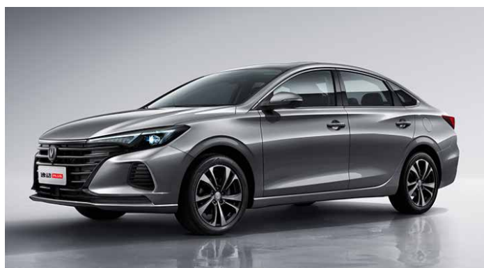
Changan EADO PLUS