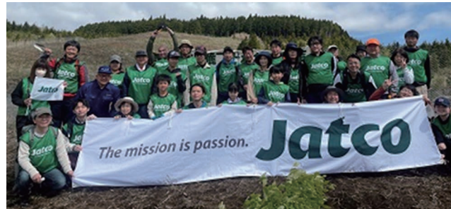
Japan Mt. Fuji Foothills Beech Forest Creation Project

Furthermore, in Japan, together with children from Fuji City Imaizumi Kindergarten, every year in June, JATCO releases sweetfish fry into the nearby Tajuku River to coincide with Environment Month. This activity, which we began in 1999, is aimed at protecting the ecosystem of the Tajuku River that runs through Fuji City where our head office is located and is undertaken in the hope that it will foster environmental awareness among the kindergarteners. We are actively tackling biodiversity conservation as a member of society.