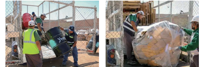
Gifting recycled goods (JATCO MEXICO)