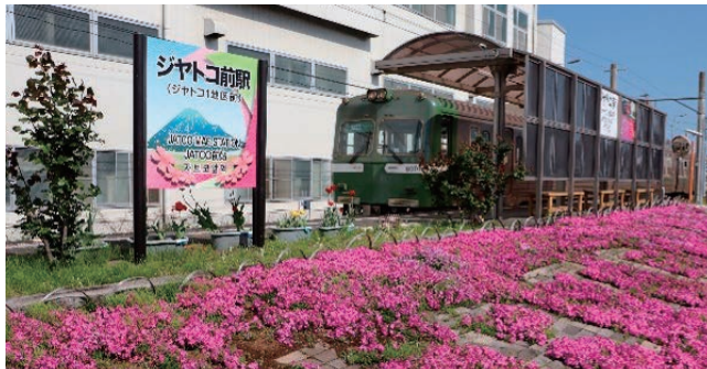
Hana-saku JATCO MAE Station Project

We are maintaining the flower beds at the Gakunan Electric Train's JATCO MAE Station to enrich the lives of everyone in the region. While responding to increasingly complex societal issues, the JATCO Group continually contributes to regional revitalization and the resolution of societal and environmental issues through dialogue with local communities.