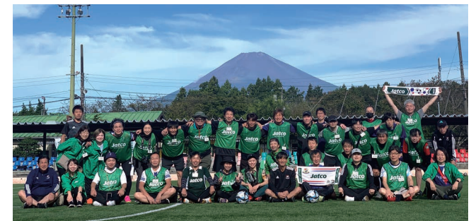
Volunteer workers who supported the soccer tournament for players with intellectual disabilities

Soccer players with intellectual disabilities have only limited opportunities to demonstrate the results of their training. Therefore, JATCO has been organizing the JATCO × Yokohama F. Marinos Futuro Cup (now the JATCO Cup) together with the Yokohama F. Marinos soccer club since FY2015. We continue to support many athletes with intellectual disabilities, along with their teams, with the goal of them participating in this tournament and having an opportunity to know the joy of soccer once again.