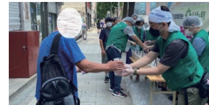
Free food distribution (JATCO Korea Engineering / JATCO Korea Service)