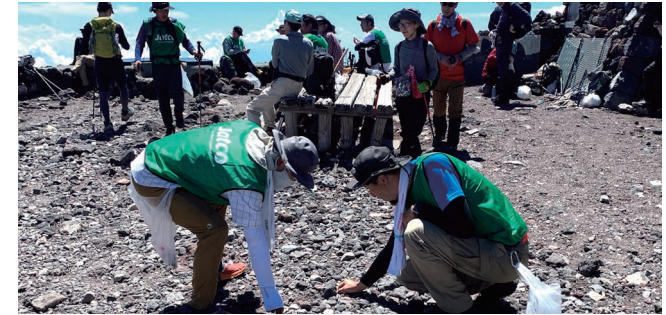
Trash collecting activities on the summit of Mt. Fuji

Together with Fuji City Hall, we organize volunteers to pick up trash along a climbing route running from the coast to the summit of Mt. Fuji. This not only protects the environment of Mt. Fuji, a World Heritage Site, but also helps preserve the mountain's ecosystem.