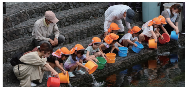
Japan Releasing sweetfish fry