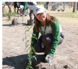
Mexico Tree-planting in Aguascalientes State