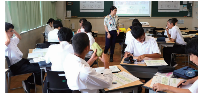
Mirai Lecture at Shizuoka Prefectural Fuji High School

In cooperation with local schools, JATCO Group companies assist in youth career formation. Employees visit nearby elementary, junior high and high schools as lecturers, helping create opportunities for the students to think about their own futures through conversations about the fun of monozukuri and the motivation of work, stories of challenges, choosing a career, etc.