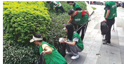
Subway station environmental protection (JATCO (Guangzhou) Automatic Transmission Ltd.)