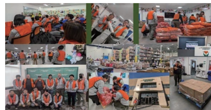
Food donations (JATCO USA)