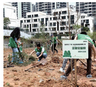
China Tree-planting in the Guangzhou Development Zone