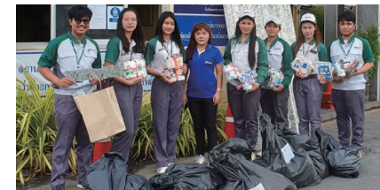
Beverage container recycling activities (JATCO (Thailand))