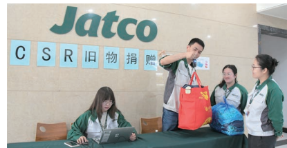
Donating recycled goods (JATCO (Suzhou) Automatic Transmission Ltd.)