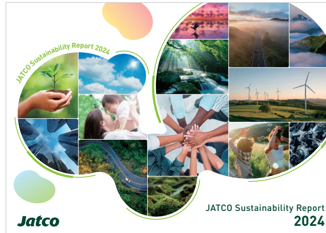
JATCO Sustainability Report

In order to promote widespread understanding of our activities amongst our stakeholders, we have published our Environmental Report since 2005. From 2009 onwards, we expanded the focus to include societal topics, and changed the title to the "Environmental & Social Report." From 2023, we consider sustainability to be the core of our management activities, and have revamped the structure of our Sustainability Report in order to more clearly convey information about our efforts to contribute to economic development and to resolve social issues through all of our business activities and other undertakings.